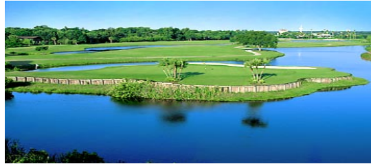
2007 Battery Alliance Open – Vinoy’s Exclusive Private Course

Name(s): *Rent Clubs? R or L? _____ _____ _____ _____ _____ _____